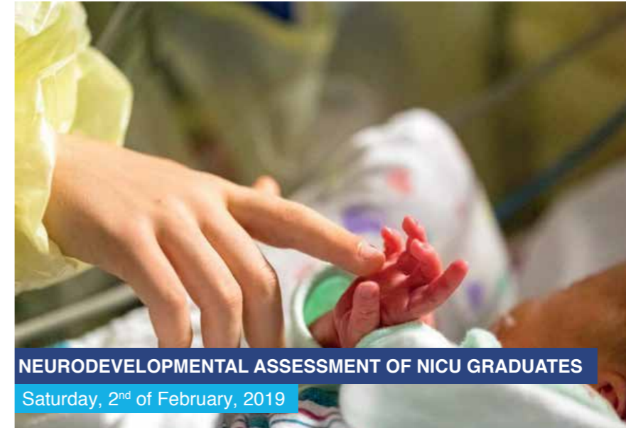
NEURODEVELOPMENTAL ASSESSMENT OF NICU GRADUATES