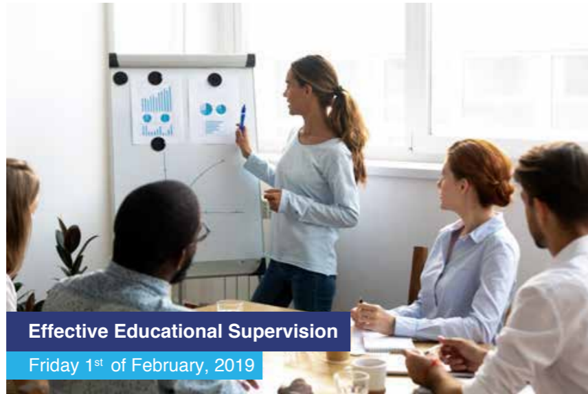
Effective Educational Supervision